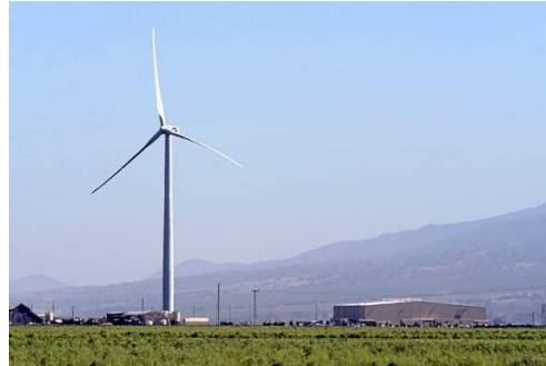
Taylor Farms windmill in Gonzales in 2014.