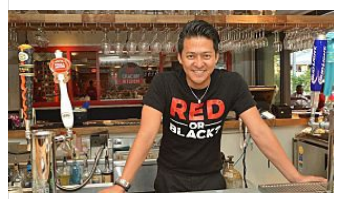
RETAILING AND RESTAURANTS Waikiki restaurant takes whole new approach to attracting visitors