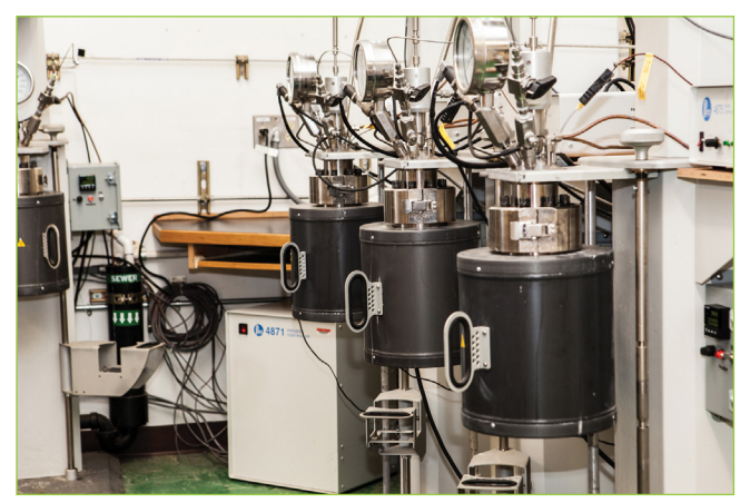
To better understand geologic formations, researchers at NETL's High-Pressure Immersion and Reactive Transport Laboratory in Albany are studying subsurface systems.

The overall objective of the Carbon Storage Program is to develop and advance carbon capture and storage (CCS) technologies both onshore and offshore that will significantly improve the effectiveness of the technologies, reduce the cost of implementation, and be ready for widespread commercial deployment in the 2025–2035 time frame. Technical and economic barriers must be addressed and data generated to inform regulators and industry on the safety and performance of CCS. NETL capabilities have been employed to pursue CCS goals in two technology component areas: (1) Advanced Storage Research and Development (R&D) and (2) Storage Infrastructure. A third area, Risk and Integration Tools crosscut these two areas.