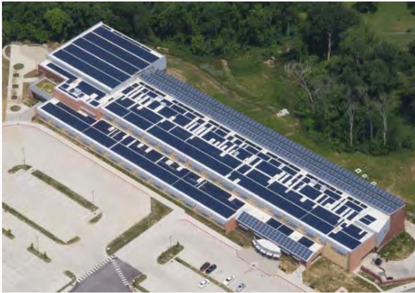
Turkey Foot Middle School Kenton County