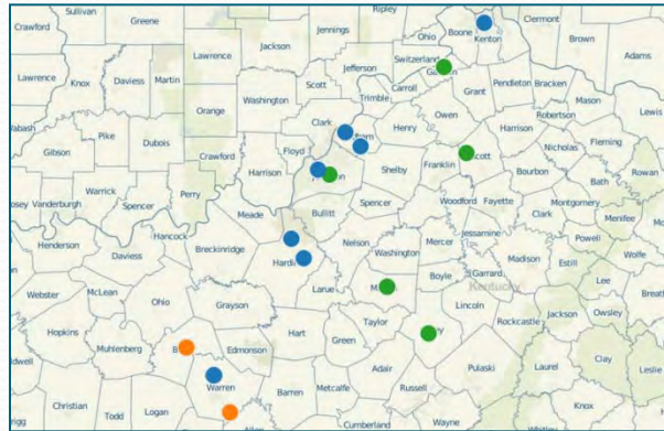
17 ENERGY STAR Labeled Schools