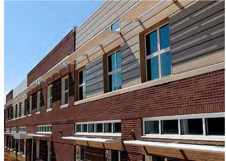
Richardsville Elementary School Warren County