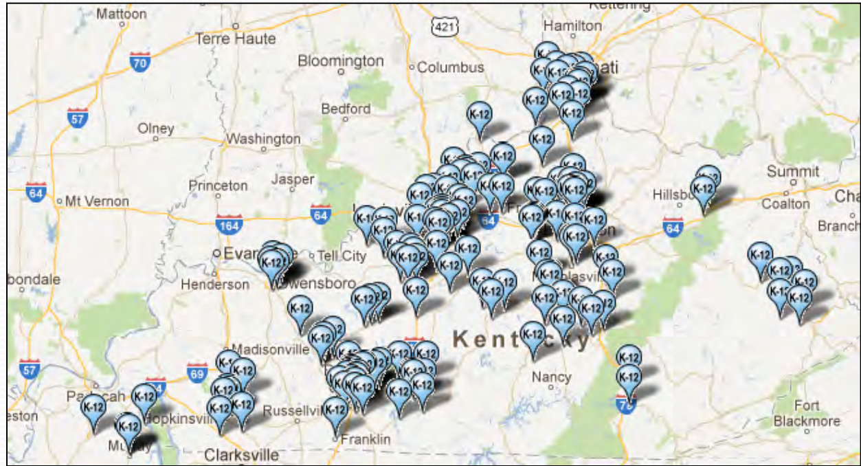
169 ENERGY STAR Labeled Schools

The ENERGY STAR labeled schools use 20-30 less energy than traditionally built schools.