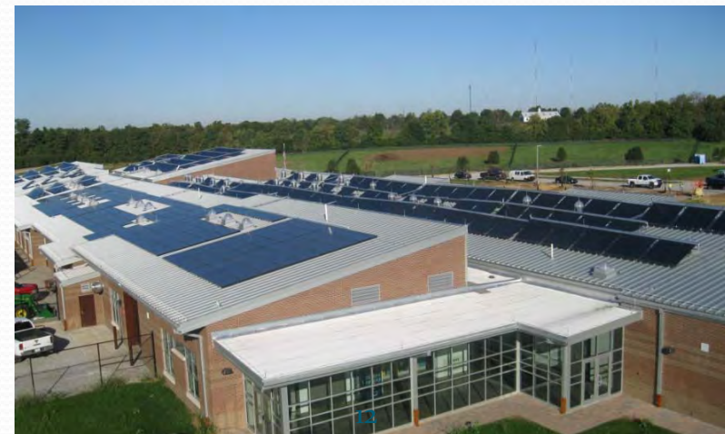
Locust Trace Campus Fayette County