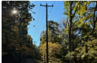
New Virginia Laws to Improve Grid Utilization and Increase Energy Storage