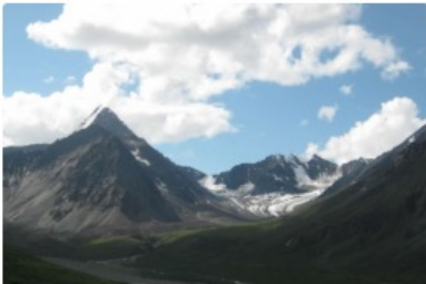
Alaska Awards $17.7 Million to Strengthen Transmission Infrastructure

NASEO can also amplify Affiliate posts on LinkedIn.