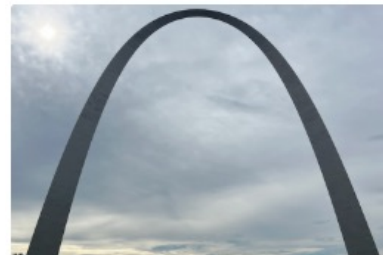
Missouri Kicks-Off State Energy Planning Process