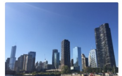
Illinois Issues Executive Order to Advance Nuclear Power Generation